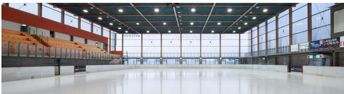
General view of the arena

On the other hand, the secondary arena disposes of 1,000 standing places, five changing rooms and one refreshment room.